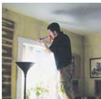
» Air leaks around windows can easily be remedied with caulk, weather stripping or low-expansion foam.

to first select a product that fits your needs. When considering heating appliances, natural gas units typically save money over electric products, perhaps even those electric products that are Energy Star-rated. Purchasing an Energy Star-rated high-efficiency gas storage water heater can save an estimated $30 a year, while whole-house gas tankless water heaters can save $115.