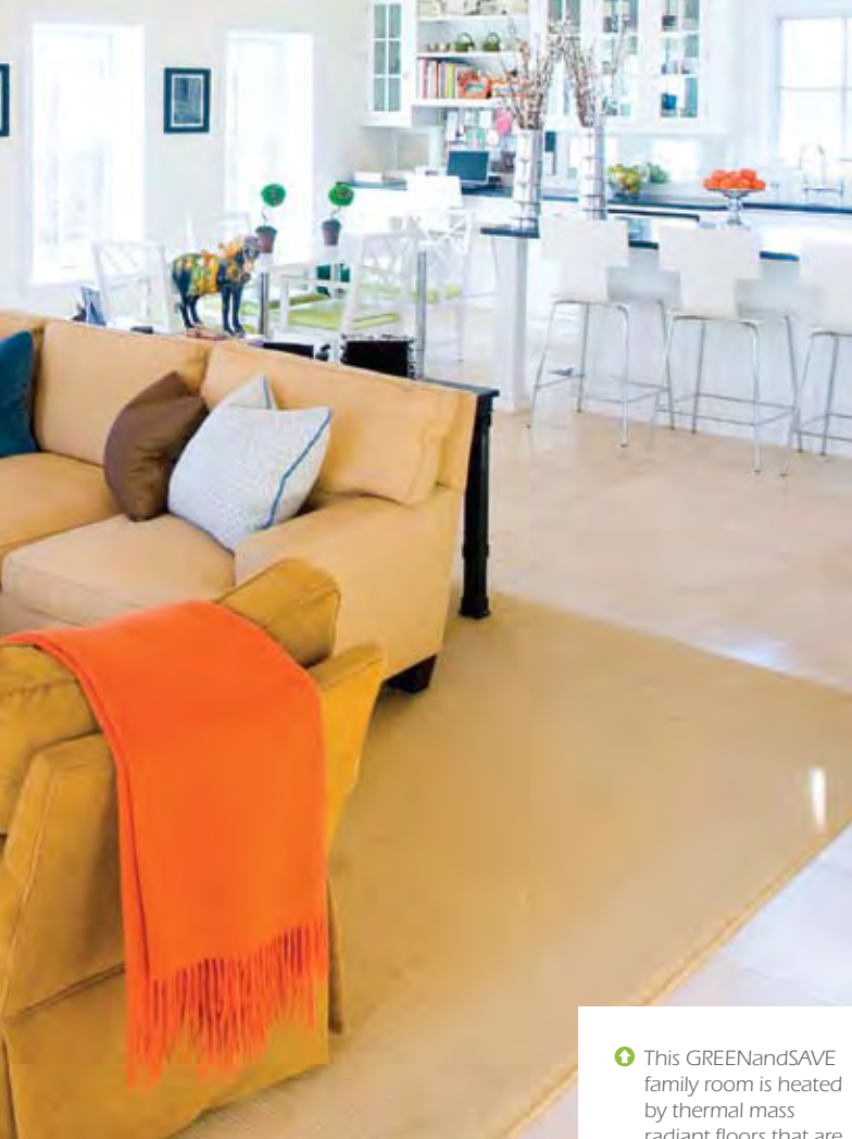
↑ This GREENandSAVE family room is heated by thermal mass radiant floors that are powered by solar hot water roof panels.

system, developed by Climate Energy and Honda, is powered by a Honda engine that runs on natural gas to produce more than 11,000 BTU of heat and 1.2 kilowatts of electricity, which can handle the energy needs of an average size home by producing smaller amounts of heat 24/7. The unit works with hot water and warm air heating systems. Options for the hot water system include a high-capacity, water-heating package.