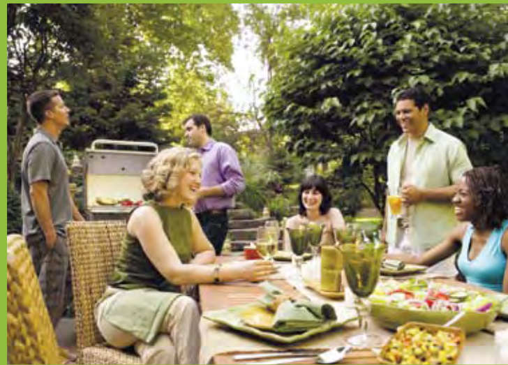
Trends in grilling like cooking with a plank and using grilling baskets add a new twist to the backyard barbecue.