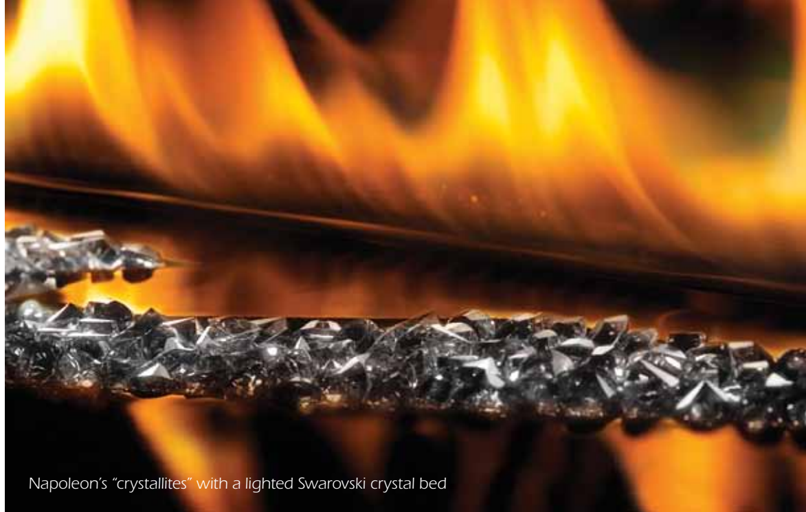
Napoleon’s “crystallites” with a lighted Swarovski crystal bed

A class of its own: Some modern fireplaces are so unique that they don’t quite fit into any given category. Such is the case for Heat & Glo’s Cyclone — which the company says is better described as “fine art” than a conventional fireplace. The Cy-