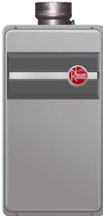
Tankless water heaters can be installed either inside or outside the home; this is a Rheem indoor unit.

One of the big selling points of the tankless system — other than offering a much lower amount of carbon dioxide emissions — is the endless supply of hot water. “I served as the marketing director of a gas utility for many years, and it was very seldom that a customer called to complain about how much it cost to heat their water,” Aikens says, adding that he did receive calls from people wanting to have access to more hot water. “With tankless water heaters, that’s not a problem.”