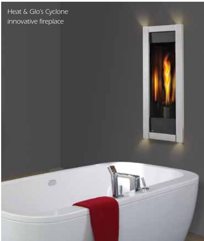
Heat & Glo’s Cyclone innovative fireplace

Napoleon’s optional “crystallites” provide accent lighting from underneath the glass ember bed, offering a glow with or without flame. There’s even a glitzed-up version for those who like extra sparkle: a lighted Swarovski crystal bed. ■