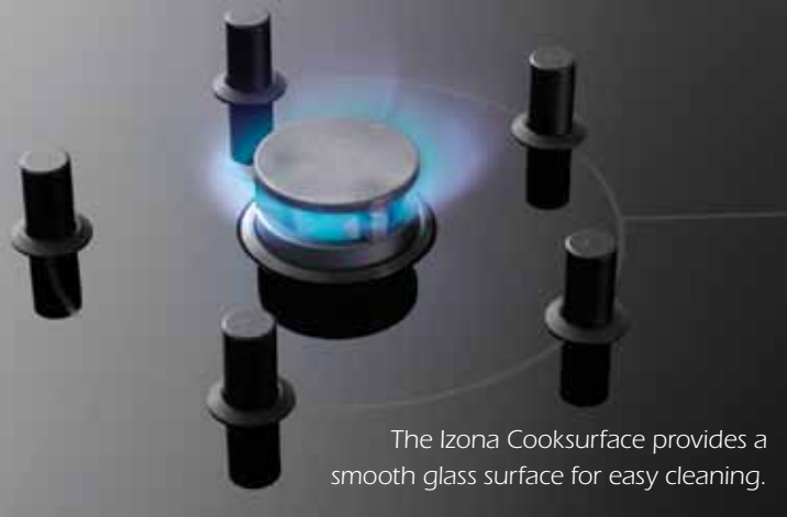
The Izone Cooksurface provides a smooth glass surface for easy cleaning.

Indeed, simple is the “in” look this design season. The National Association of Home Builders’ (NAHB) January 2010 survey of home builders reports that kitchen size will remain about the same, but designers will eliminate walls and raise ceilings. Energy efficient appliances are a definite must.