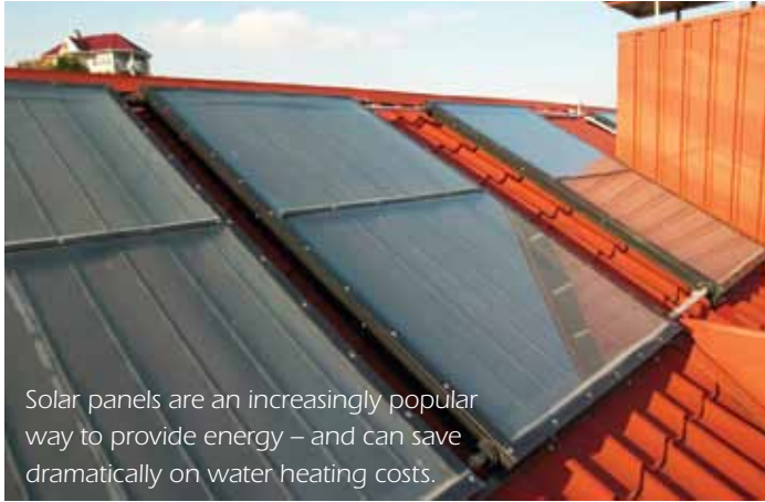
Solar panels are an increasingly popular way to provide energy – and can save dramatically on water heating costs.