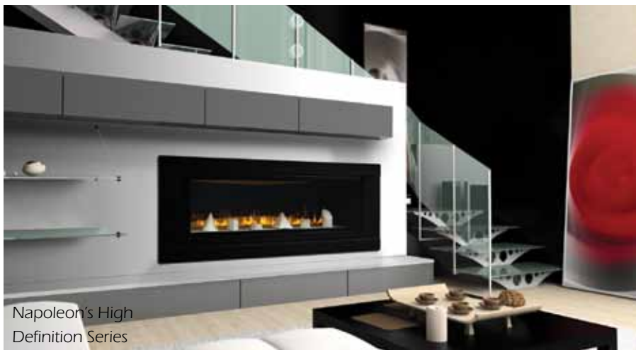
Napoleon’s High Definition Series

Between their “widescreen” look and simple black frames, modern fireplaces have begun to mimic the shape, size and height of flat-screen televisions. Napoleon’s High Definition Series — notable for its unobtrusive “clean face frame” to maximize fire viewing — has actually been mistaken for a flat-panel TV inside Hearth & Stone in