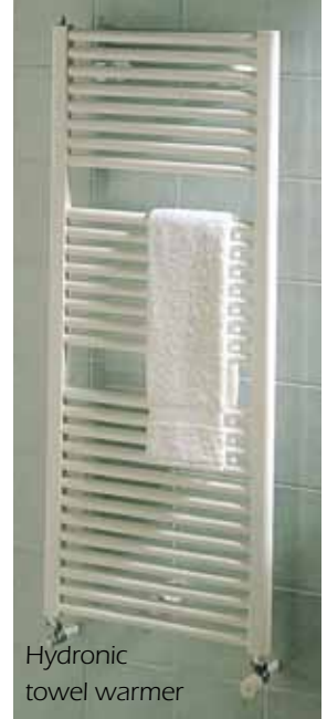
Hydronic towel warmer

Gas space heaters provide the perfect solution for heating small spaces.