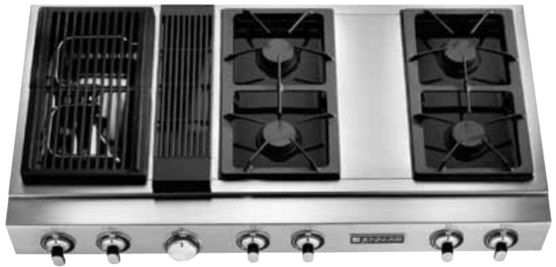
Jenn-Air's modular downdraft cooktop brings the grilling experience inside.

"The future of kitchens is in the integration of elements," says renowned architect and designer Campion Platt. "Virtually all the equipment can be hidden, thus the room can be transformed more to a living than just a function space. More people are opting for eat-in kitchens and also combining kitchen rooms with family rooms. Accordingly, the design of kitchens will become less functional looking and more appealing as an interior room, more connected to the rest of the house."