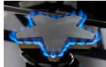
Thermador's Star Burner reinvents the old circular burner to allow even heat distribution.

When it comes to style meeting substance, nothing tops Thermador's Star Burners. This dramatic star-shaped burner allows even flame and heat distribution, and Thermador recently introduced an elevated burner with increased output that fuels performance and allows for quick and easy clean-up.