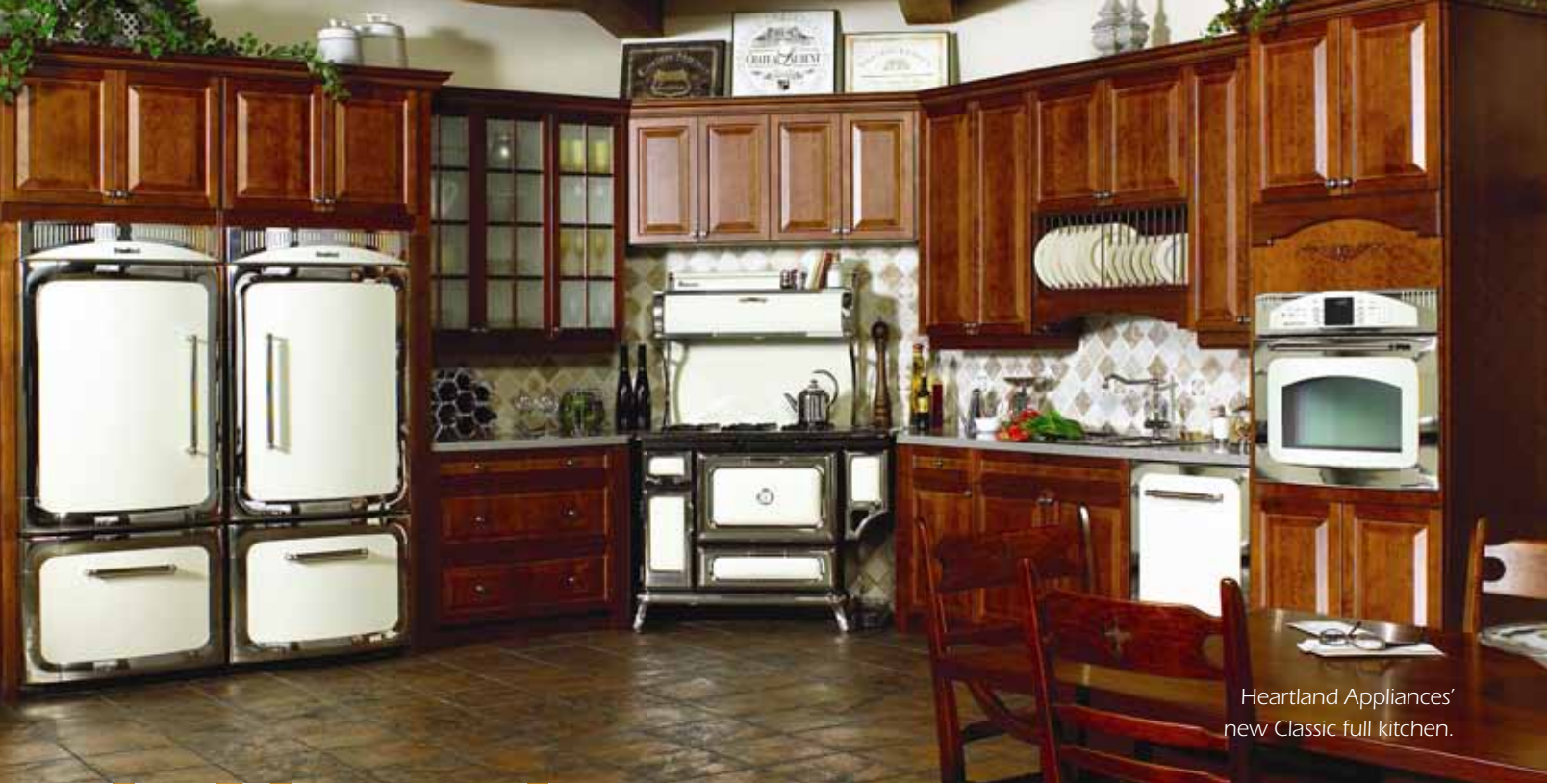
Heartland Appliances' new Classic full kitchen.